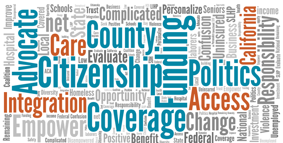
Theme Cloud for Responses from All Interviewees

The theme cloud below represents the combined responses from the interviewees. The size of each theme, relative to others in the cloud, is a visual representation of how often that particular idea or comment was brought up by the interviewee: