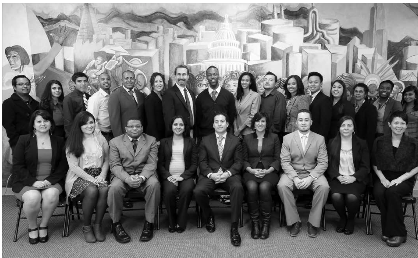
Message from the team at Greenlining