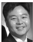
Assemblyman Ted Lieu , Assembly District 53 California State Legislature

Assemblymember Ted Lieu was elected to the 53rd Assembly District in a Special Election in September 2005 and re-elected in November 2006. Lieu is Chair of the Assembly Rules Committee and currently serves on the following standing committees: Banking & Finance, Appropriations, Veterans' Affairs, and Water, Parks & Wildlife. He was also appointed Chair of the Assembly's Select Committee on Aerospace. Prior to his election to the State Assembly, Lieu served on the Torrance City Council. Dedicated to his country, Lieu currently holds the rank of Major in the United States Air Force Reserves. He served on active duty for four years as a member of the JAG Corps. Lieu graduated from Stanford University in 1991 earning a bachelor's of science in computer science and a bachelor of arts in political science. In 1994, he graduated with a juris doctorate with honors from Georgetown University Law Center where he was Editor-in-Chief of the Law Review.