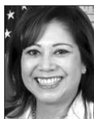
Congresswoman Hilda L. Solis , California's 32nd Congressional District, U.S. House of Representatives

First elected in 2000, Congresswoman Hilda L. Solis is serving her fourth term in the U.S. House of Representatives. She represents California's 32nd Congressional District, which includes portions of East Los Angeles and the San Gabriel Valley. Prior to her election to Congress, Solis served eight years in the California state legislature. In August 2000, Solis became the first woman to receive the John F. Kennedy Profile in Courage Award for her pioneering work on environmental justice issues in California.