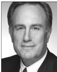
Ivan Seidenberg Chairman and Chief Executive Officer Verizon Communications

Ivan Seidenberg is chairman of the board and chief executive officer of Verizon.